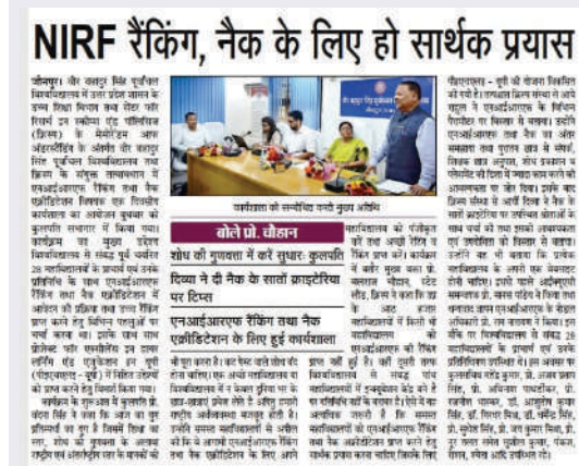
Our activities have been featured in a few news media