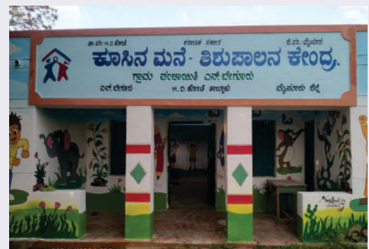
Newly setup crèche at Begur GP (Mysore District)

As the initiative unfolds, CRISP's involvement ensures effective implementation, contributing to the success of Koosina Mane in transforming childcare and fostering holistic development in Karnataka.