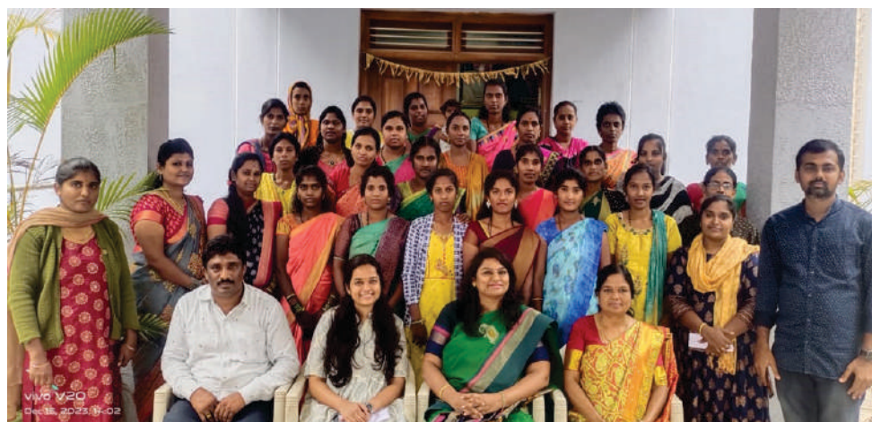
CRISP Representative with Zilla Panchayat CEO, Kolar District and trainers at Crèche workers’ training program, Kolar