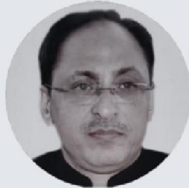
Sitaraman Janardan Kunte IAS - 1985