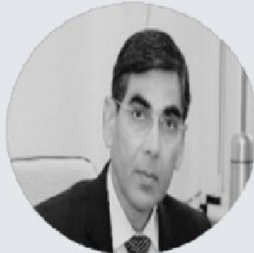
Radhey Shyam Julania IAS - 1985