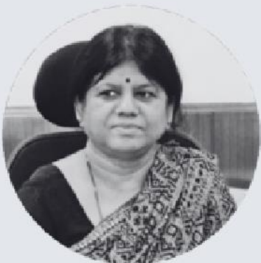
Pushpa Subrahmanyam IAS - 1985