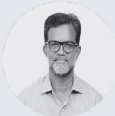
Rajiv Sadanandan IAS - 1985